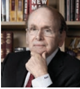
Daniel Yergin Vice Chairman S&P Global